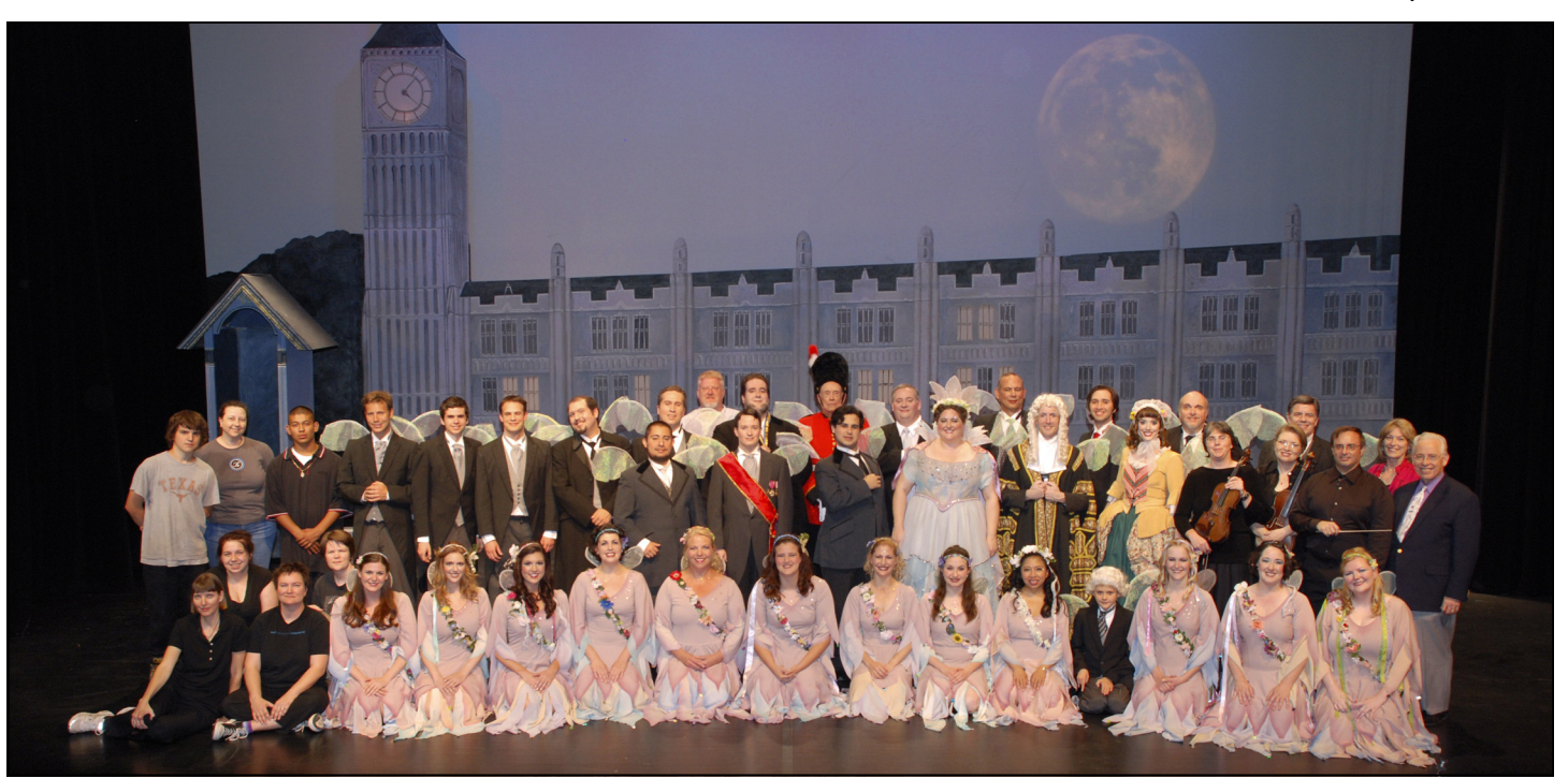
The Iolanthe cast and crew