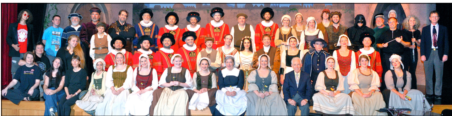
(above) Cast and crew of The Yeomen of the Guard . (below) The poignant finale. (next page) Assorted scenes from Yeomen .