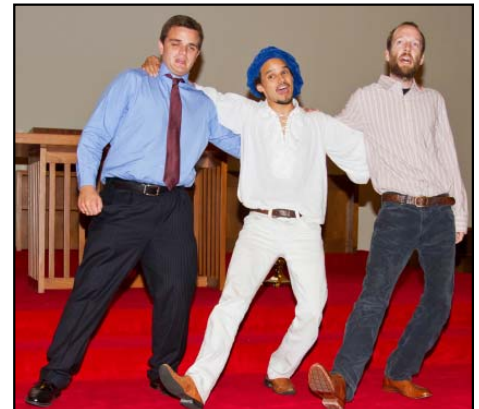
“I am a maiden”