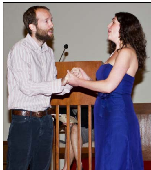
"Stay, Frederic, stay"