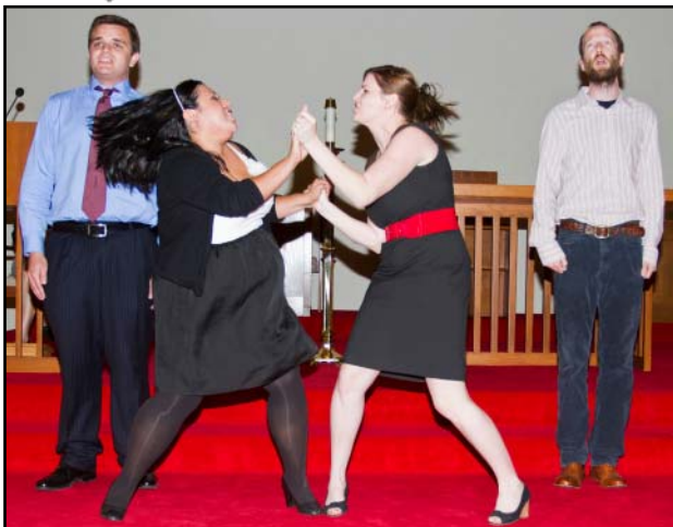
"In a contemplative fashion" -- see page 2