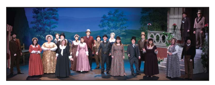
the Villagers of Ploverleigh